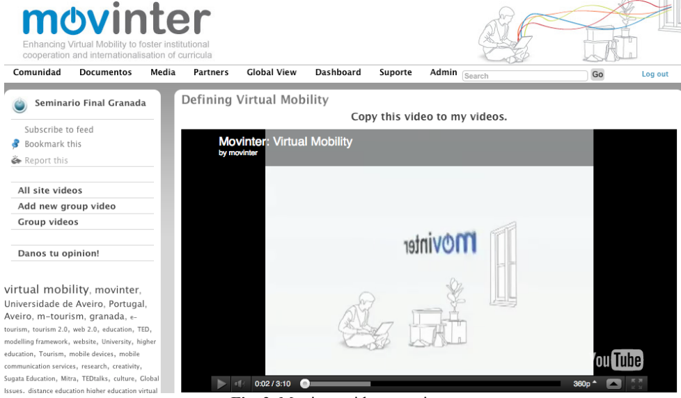
Fig. 2. Movinter video repository

This community (born in 2008) has grown up to 100 active users with 6 groups and 40 best practices of international cooperation between institutions. Members posted documents and events to share knowledge about good practices towards the virtual mobility cooperation between institutions. Contributions are the main outcome of the community, in terms of useful links, paper positions, videos explaining concepts, etc. This information (as shown in Figure 2) is relevant for decision makers for better understanding of this approach and also to generate group dynamics between members.