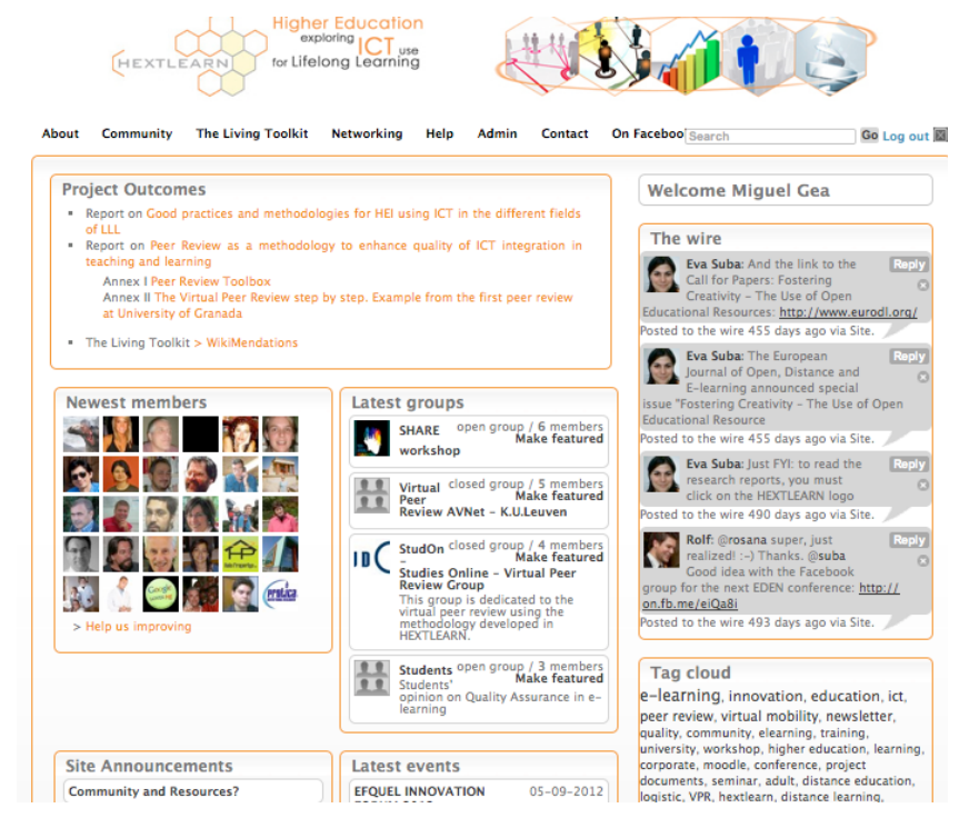
Fig. 3. Hextlearn community

This is an active community (born in 2009) with more than 750 active users, 36 groups and 76 best practices reported by users. Community is built around different learning territories, with a relatively high community of experts and several procedures to share best practices, to ask for a review and to prepare a (blind) peer review in the same community.