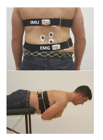
Figure 2: mDurance sensors deployment. Both IMU and EMG sensors are attached to the lumbar zone to ensure stability and comfortability.