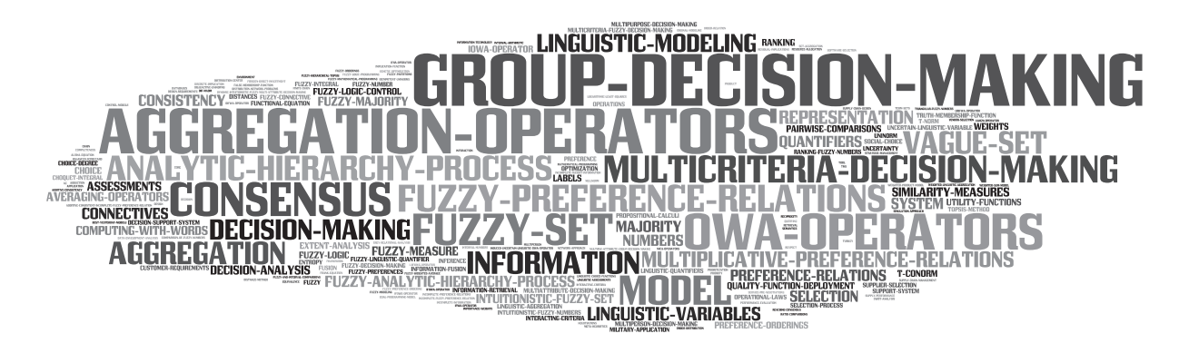
Fig. 2. Cloud tags