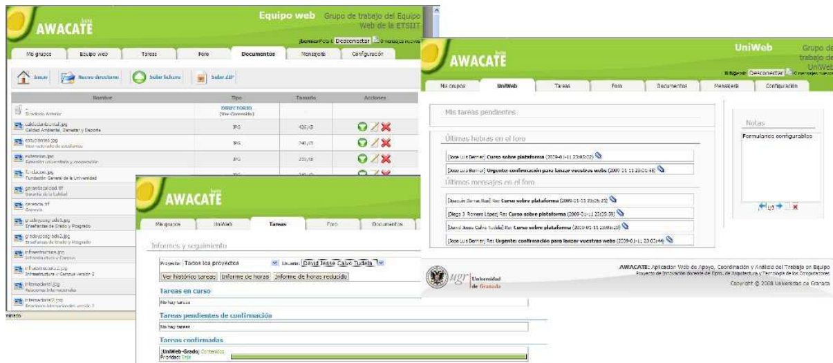
Fig. 1. Snapshots of some tools on the platform.

Other educational or e-learning platforms follow a hierarchical structure where a teacher (or several teachers) manages a student group. Instead of that behavior, AWACATE enables any user to set up a group regardless this user is a teacher or a student. This feature makes AWACATE an unique educational platform able to complement others, covering some aspects that these platforms may not have, for example: