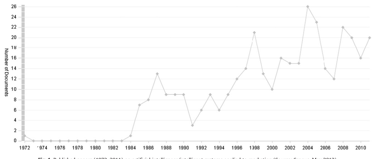
Fig. 1. Published papers (1972–2011) on artificial intelligence/intelligent systems applied to marketing (Source: Scopus, May 2012).